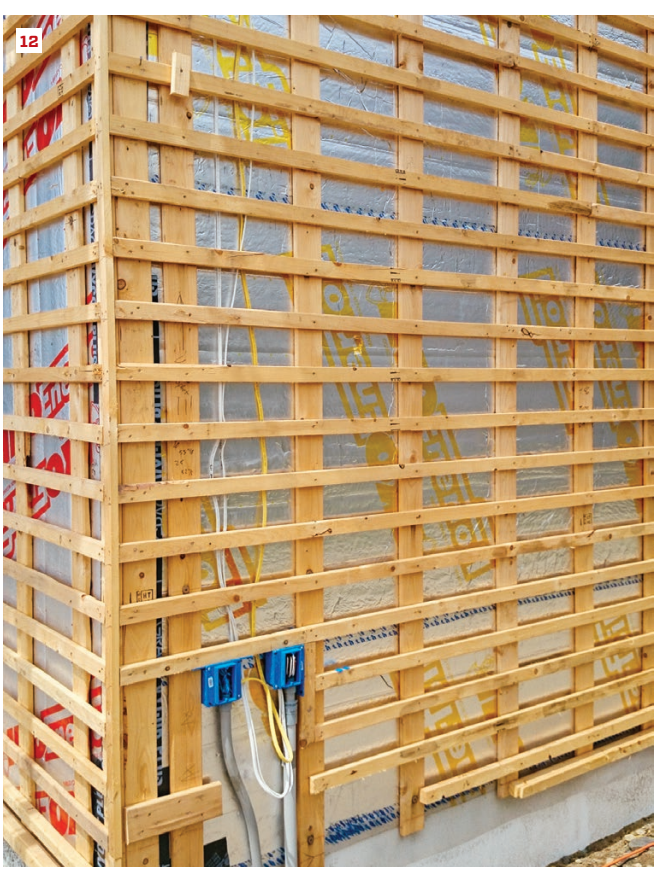
A second horizontal layer of furring provides nailing for vertically applied siding, such as this corrugated metal (10). If there isn't enough depth for the second layer of furring, the strips can be installed diagonally with breaks to allow water to drain down and out of the bottom (11). Site-built rainscreens can be used for shingle siding, but this application is labor intensive (12).

that makes it into the assembly is temporarily stored. When the sun warms the outside surface of the siding, the drive to dry the assembly is from the inside outward. The moisture moves through the assembly relatively freely until it hits the exterior paint surface, which usually challenges the drying process. Over time, this challenge to the paint surface continues, pushing on it from within and eventually causing the paint to blister. Ultimately, the blisters break, and the paint peels. In some cases, paint failure can happen in as little as four to five years.