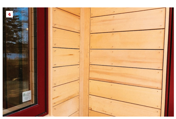
Siding nails directly over commercially available rainscreen materials like this mesh (1). With site-built systems, the siding nails to furring strips (2). With a closed rainscreen, the siding installs with a lap joint or it overlaps, as with clapboard (3). In an open rainscreen, the siding nails to the furring strips with air gaps between the boards (4).

a strong, long-lasting installation. The strapping we use for our rainscreen systems is not treated to avoid rot, although I've seen many builders who use treated 1x4 or rips of treated plywood for this application. Sometimes we paint the strapping, but that is for reasons other than avoiding rot. The reasoning behind my choice of strapping in its natural state will become clearer when we look at how this rainscreen system actually works.