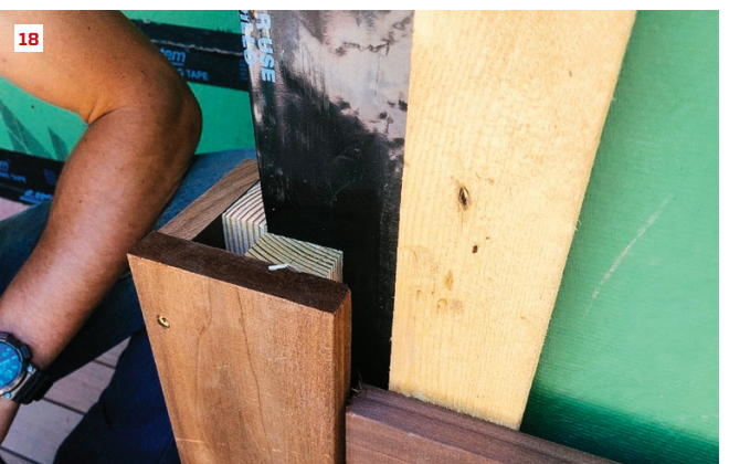
Seal all window openings and integrate them with the WRB. A flap of building paper below the window (16) layers into the building paper of the open rainscreen so that it sheds water properly (17). This mock-up of a corner shows how to leave the boards open for maximum air circulation in an open rainscreen system (18).

important. Remember that the siding is just "makeup" for the building's exterior—the real work is literally behind the scenes. Window and door integration starts with a well-designed and well-executed sill detail that allows any intruding moisture to drain away quickly. Meticulous detail should be paid to flashing and sealing the window into its opening (see "Installing High-Performance Windows," Oct/15) (16). The flap of paper under the window integrates with the layer of felt paper of the open rainscreen (17). Before the siding is installed, each window is completely water-managed and fully integrated with the rainscreen.