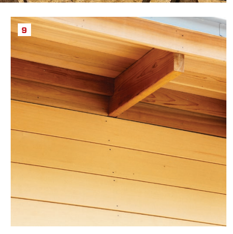
Site-built rainscreens install over the WRB, so it should be complete with all seams and openings sealed and flashed properly (5). With an open rainscreen, building paper covers the WRB to protect it from UV rays (6). Protection from critter intrusion can be either mesh (7) or corrugated vent material (8). Air space at the top of the wall allows ventilation for drying (9).

sheathing (6) . The felt paper blocks sunlight from hitting the sheathing and degrading the WRB, while creating an effective, low-tech, and inexpensive water-shedding surface for the sheathing. The strapping then installs over the building paper.